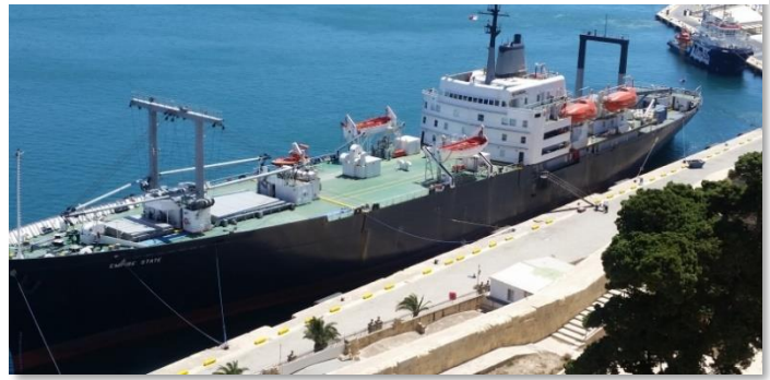
TSES Empire State Docked in Malta